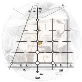
VVP Gabcikovo Charakterový Vizual blízkej urbanistickej osi