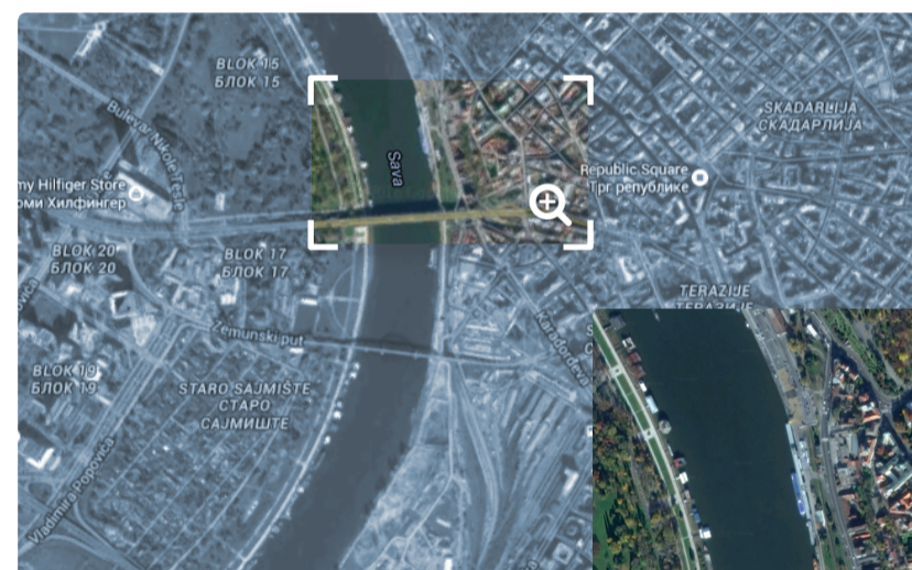
📍 KOSANČIĆEV VENAC

The area of study is a Kosančićev Venac, a historical part of the city of Belgrade . It is a heterogeneous, mixed-use area connecting the Sava riverfront with the main pedestrian zone, next to the Kalemegdan fortress. Despite its excellent position and evident potential for revitalization, this area has been deteriorating for decades, losing part of its inhabitants and failing to attract new ones. Its predominant use is residential, although there are many institutions of education and culture nearby.